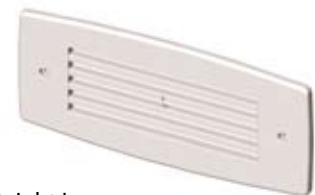
SL Straight Louver