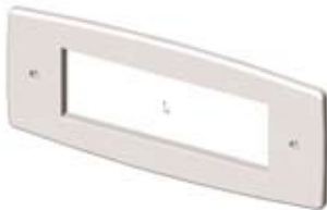
FL Full Opal Lens

5 years standard fixture with 7 year pro rated on battery where applicable.