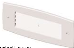
AL Angled Louver